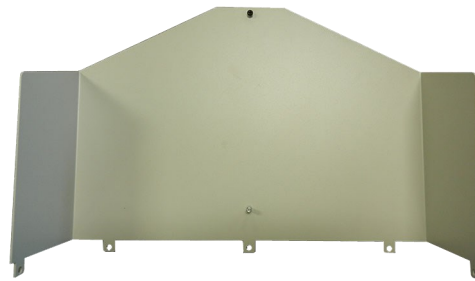
Controller Mounting Bracket